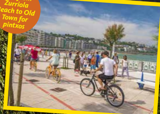
Ride from Zurriola Beach to Old Town for pintxos

WORDS BY DANIELLE SHERRING