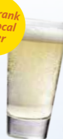
We drank the local cider

These clubs still exist, although many have relaxed the 'boys only' rule – not all – and are often hidden behind big wooden