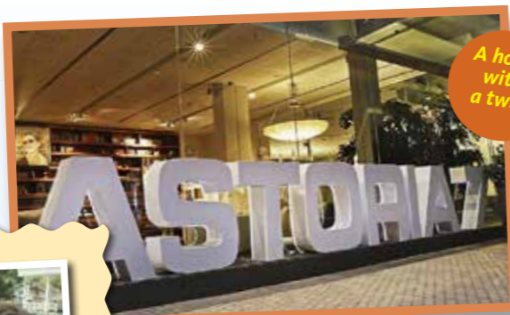
A hotel with a twist

to read about superstars like Woody Allen and Al Pacino who have fallen in love with the Spanish city as we walked through the hotel's hallways.