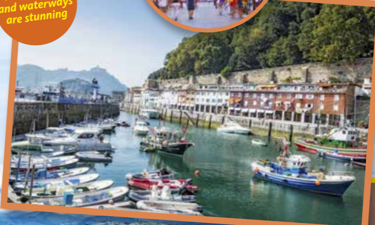
The city's architecture and waterways are stunning

Standing on top of Mount Igueldo, you'll see how much this colourful city by the sea has to offer.